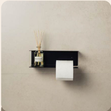
Toilet paper holders