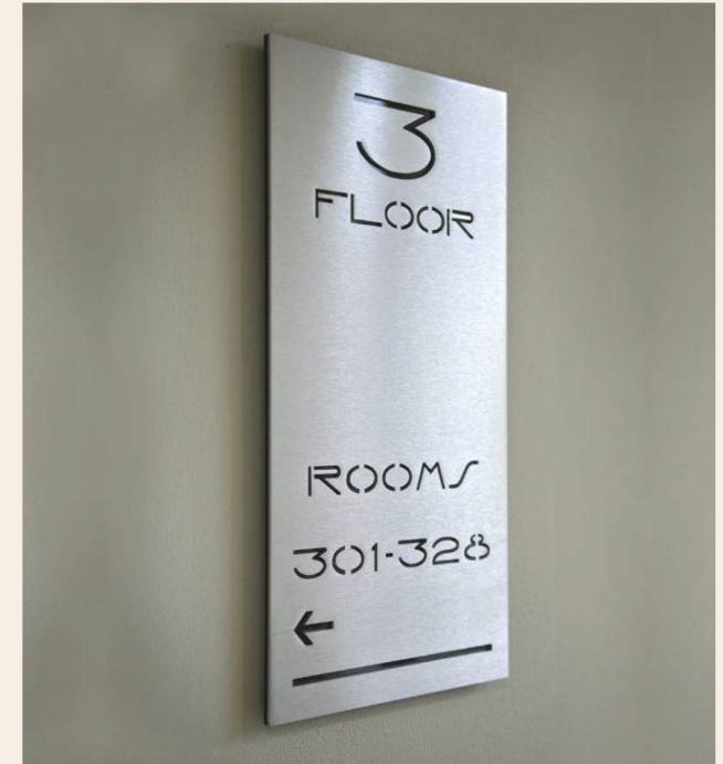
Floor number and navigation